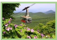
Hakkoda Ropeway image

三陸鉄道 Sanriku Railway ※The JR EAST PASS is not valid for Sanriku Railway.