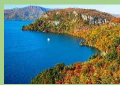
Lake Towada image